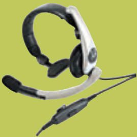
RLN5238 Sports-Style Headset with inline PTT