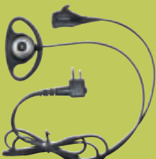
PMLN5001 D-Style Earpiece with Mic/PTT (Dual pin)