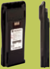
NNTN4497 Extended Lilon Battery