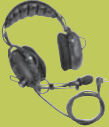
HMN9021 Medium Weight Dual-Muff Headset with Swivel Mic