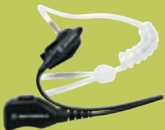
PMLN4606 2 Wire Surveillance Kit with Clear Acoustic Tube