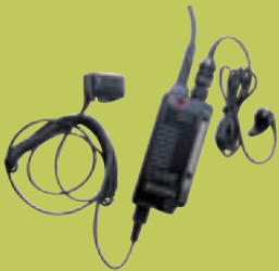
BDN6706 / 0180358E38 Ear Microphone with PTT/VOX Interface Module /Remote PTT Ring Switch (order separately)